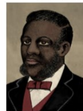
The Rev Lott Carey

You will be my witnesses in Jerusalem and in all Judea and Samaria, and to the end of the earth" - these are the last documented words Jesus spoke to his disciples before he ascended into heaven." (Acts 1:8)